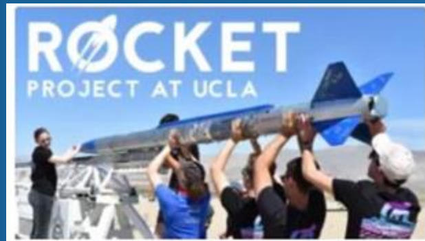
Rocket Project at UCLA