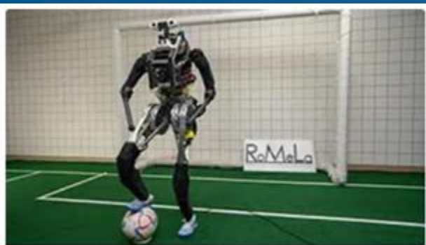
RoMeLa: The Road to RoboCup