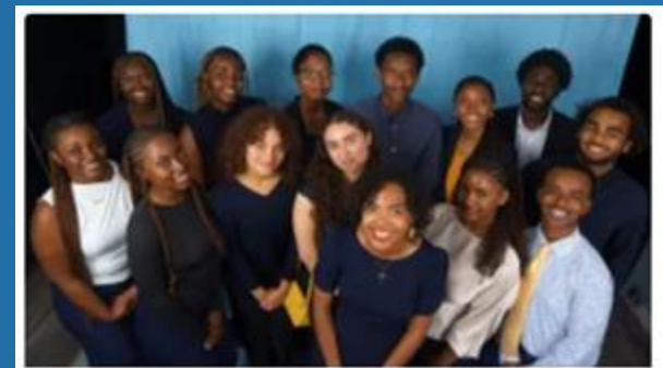
2024 NSBE NATIONALS FUND