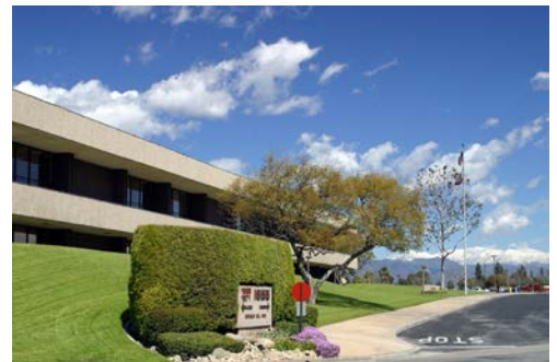
Joint Administration Office, Whittier

One student intern position is offered at our Joint Administration Office (Whittier, CA) in the Electrical and Instrumentation Design Section. The student intern will work alongside electrical engineers and participate in a variety of assignments. An intern may work part-time during the school year.