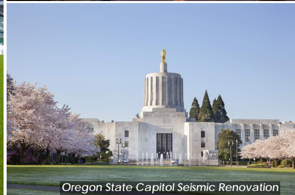
Oregon State Capitol Seismic Renovation

Our Principals and Associates are fully engaged in projects and provide daily mentorship. Our open office environment provides an atmosphere that fosters teamwork, impromptu learning sessions, and optimum communication. In addition to offering competitive salary and benefits, we provide incentive bonuses as part of the compensation package.