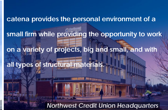
Northwest Credit Union Headquarters