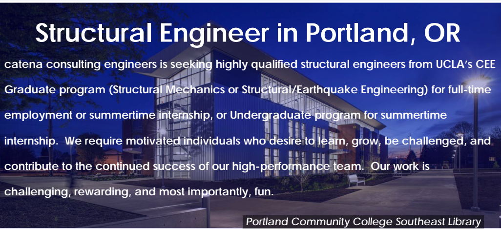
Portland Community College Southeast Library

catena consulting engineers is seeking highly qualified structural engineers from UCLA's CEE Graduate program (Structural Mechanics or Structural/Earthquake Engineering) for full-time employment or summertime internship, or Undergraduate program for summertime internship. We require motivated individuals who desire to learn, grow, be challenged, and contribute to the continued success of our high-performance team. Our work is challenging, rewarding, and most importantly, fun.