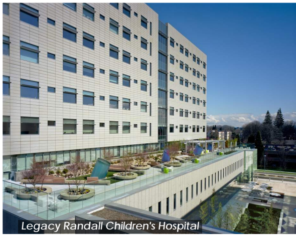
Legacy Randall Children's Hospital